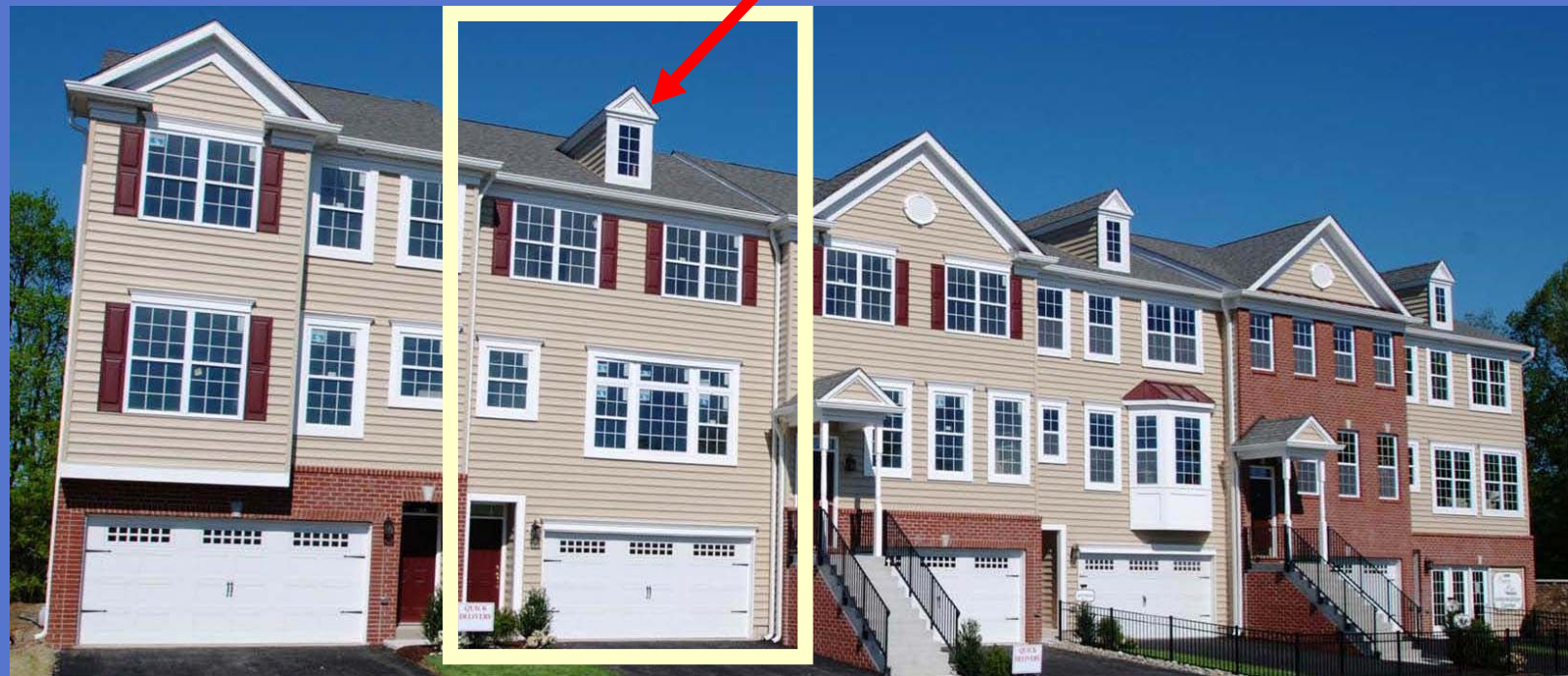
Picture depicts model not actual home.

~ Lot #14, 134 Country View Way ~ Great Location Backs to Open Space!