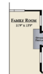
Alternate Optional Family Room Fireplace