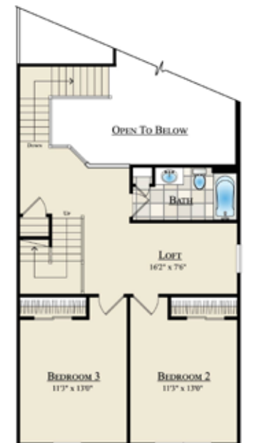
Second Floor Layout at Optional Third Floor Loft