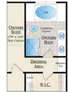
Optional Owner's Bath with Soaking Tub