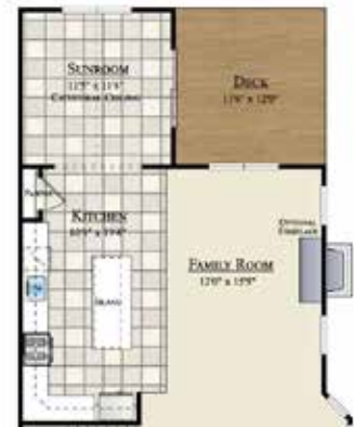
Optional Sunroom with Optional Fireplace Location