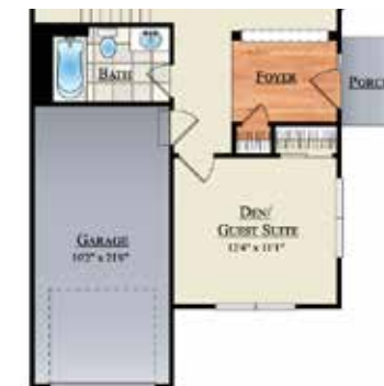
Optional Den/Guest Suite