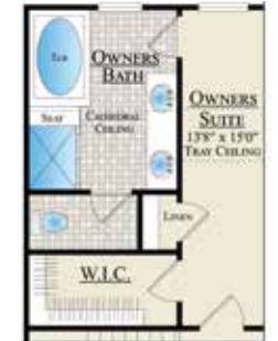
Optional Owner's Bath with Soaking Tub