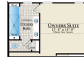
Optional Owner's Bath with Super Shower